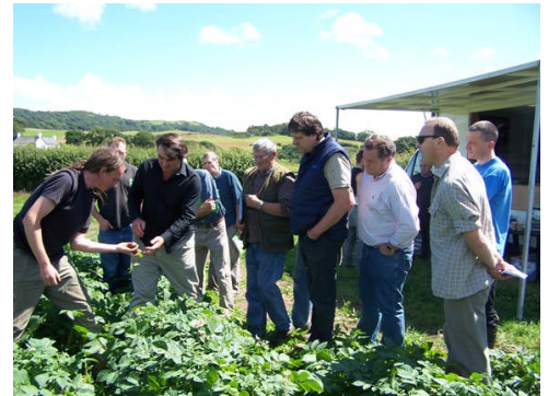
Looking at Sárpo seed potatoes