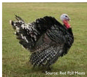
Norfolk black turkey

small scale producers need to use traditional strains of birds (e.g. bronze or Norfolk black).